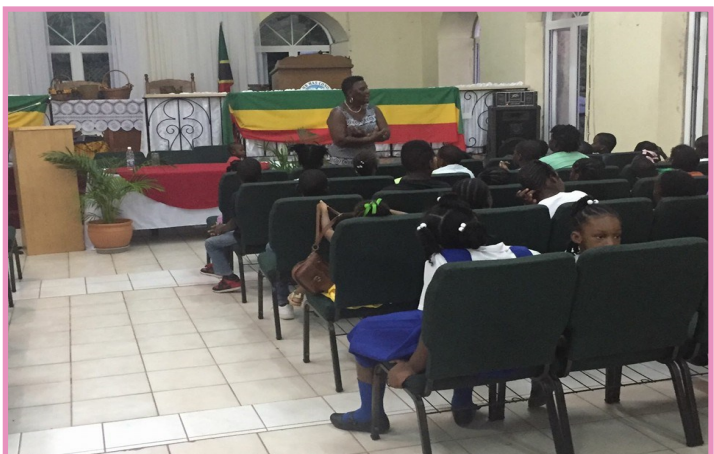
Children Evangelistic Service: I AM AVAILABLE!