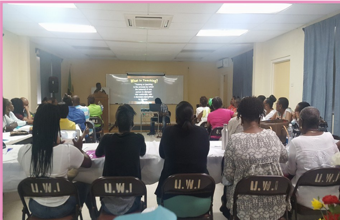
Sunday School Teachers' Conference — Day 2