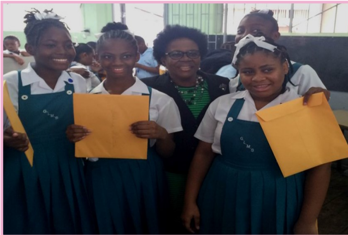
Student and Teacher of the GLMS

The Gloster Lodge Moravian School of the Trinidad Conference ended its year-long 120 Anniversary Celebrations on Friday 24 June, 2016. A Principal's holiday was granted on that day by the Ministry of Education in recognition of the many achievements of the school over its 120 years of existence.