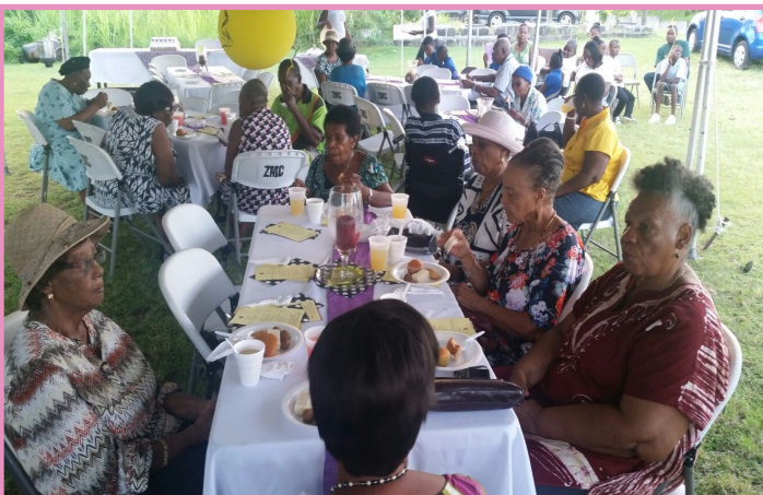
70+ Tea Party at Bethesda (served by the youths)