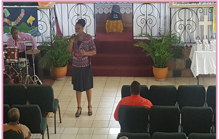
Sunday School Superintendent Exchange