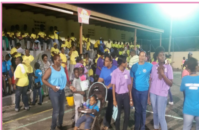
Sunday School Rally & Open Air Service—Dorset Park