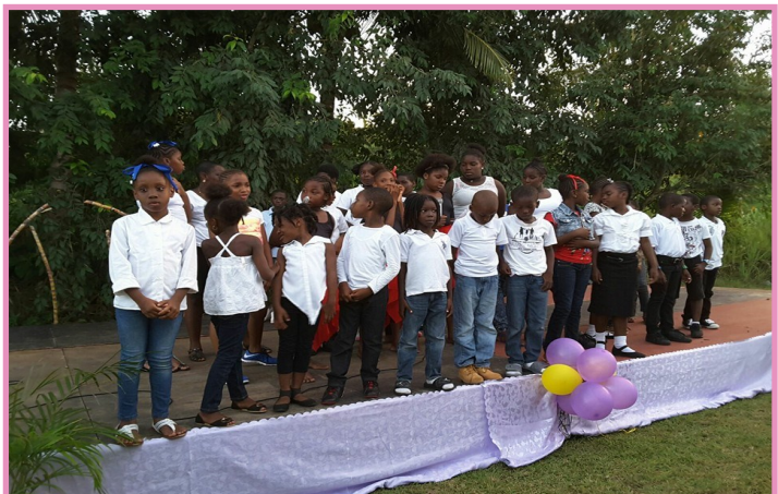
70+ Tea Party at Bethesda—Concerts by the Youths