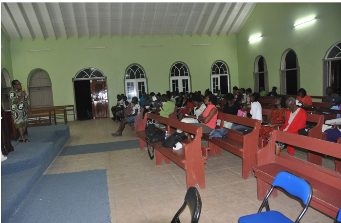
Bible Study @ Bethel - Who are the Moravians