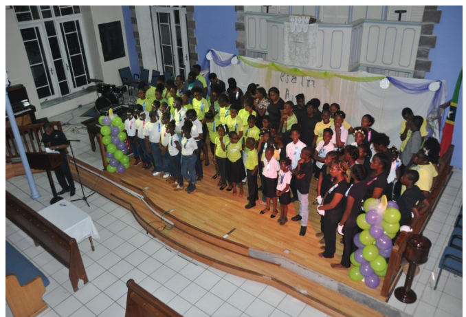
Psalm Alive @ Zion