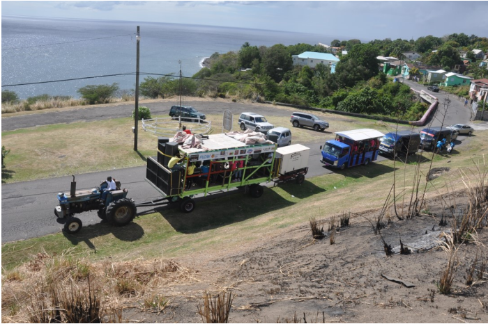
Motorcade—Tracing our steps Palmetto Point to Bethel