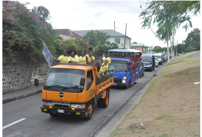
Motorcade (Cayon Street) on route to Bethel