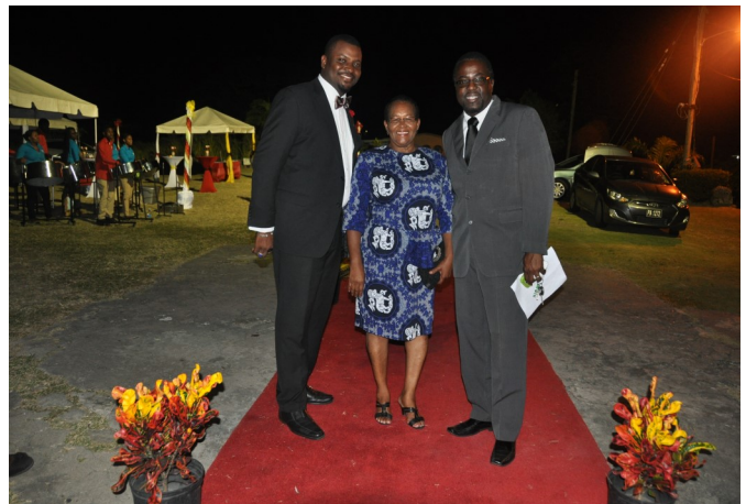
Pastors at the Gala @ Bethesda