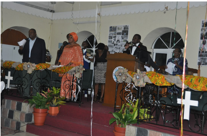
Moravian Birthday Gala—Church Service @ Bethesda