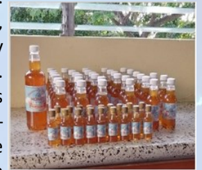
First Honey Extraction.

Over one hundred 750ml bottles of honey have been obtained thus far; bottled and sold as a means of generating income for the church family. As this initiative continues to thrive, succession planning and continuity of our Apiary is part of the plans. Resultantly, the Heavenly Hives group uses every possible opportunity to educate and inform the members from the VBS (Vacation Bible School) groups, Sunday School groups and also the general