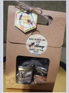
Honey Products-Gift Package

Presently, under construction, in accordance with the Beekeeping and Bee Products Acts of Trinidad and Tobago, is a honey home, annexing the church kitchen, as a way of ensuring that the Heavenly Hives Apiary, adheres to the specified regulations and is provided with its own production and storage area.