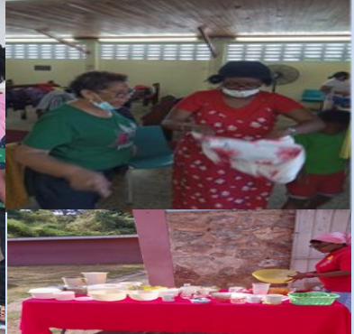
Rosehill Moravian Women at Goshen