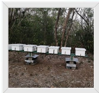
The Brood boxes/ Hives

The initial apiary site comprised of five (5) colonies, which was further increased to ten (10) colonies in a couple of weeks, was blessed by our then Pastor, Reverend Nevin Tito Lewis, who wholeheartedly supported this venture. Resultantly, the first honey extraction process occurred within two months of our brief existence, on June 15 th , 2021. Although the extraction process was manually done, it was a labour of love. This first extraction was mainly used as gifts and souvenirs to the church family, and a bottle was used to create church memorabilia for future reference. At present, due to a generous donation by a blessed church member, the Heavenly Hives group was gifted an electronic extractor, which reduces the extraction time.