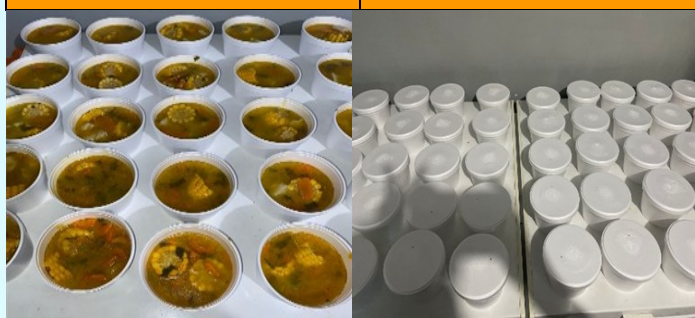
Memorial Moravian Goshen Soup Kitchen