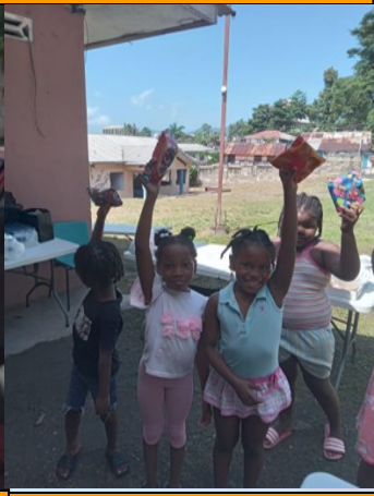
Children at Rose Hill Moravian Goshen