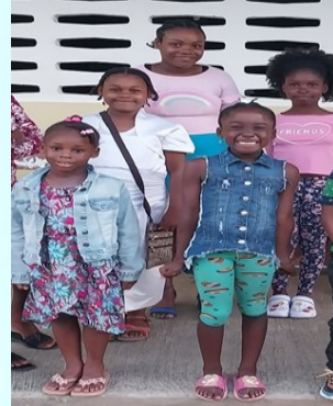
Children at L'Anse Noire Moravian Goshen