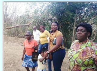
Blessing the second Apiary Site.