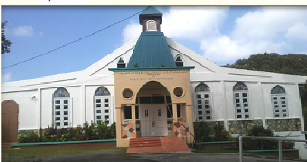
Cedar Hall Moravian Church, Now