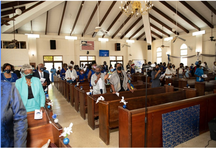
The congregation gathered in Worship and praise.

The 250 th Anniversary Service of the Friedensberg Congregation was indeed an inspiring, wonderful, and challenging experience. Heartiest congratulations and encouragement are extended to the church as it seeks to represent Christ in the western end of the beautiful Island of St. Croix while loving the lost, living the message and lifting the Savior.