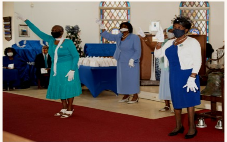
The Women's Fellowship offer a sign of “Total Praise” to begin the worship. In the background is the bell that was rung from the previous church building.

Taking part in the service were the Women's Fellowship who started the service with a sign language item to “Total Praise”,