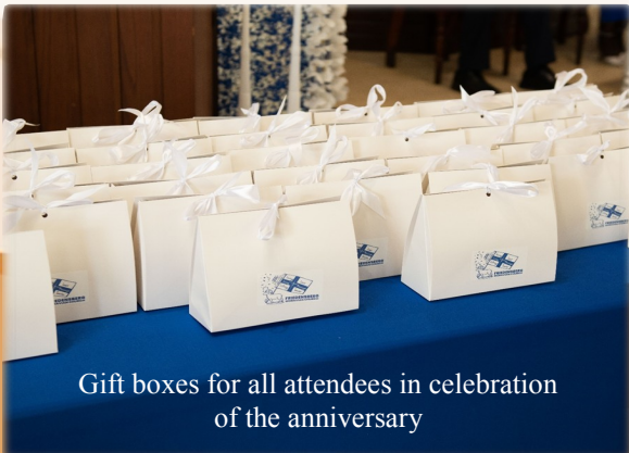
Gift boxes for all attendees in celebration of the anniversary

The 250 th Anniversary Service of the Friedensberg Congregation was indeed an inspiring, wonderful, and challenging experience. Heartiest congratulations and encouragement are extended to the church as it seeks to represent Christ in the western end of the beautiful Island of St. Croix while loving the lost, living the message and lifting the Savior.