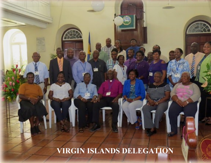
VIRGIN ISLANDS DELEGATION