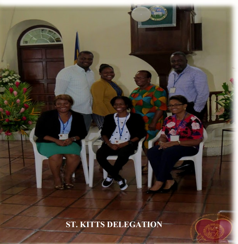
ST. KITTS DELEGATION