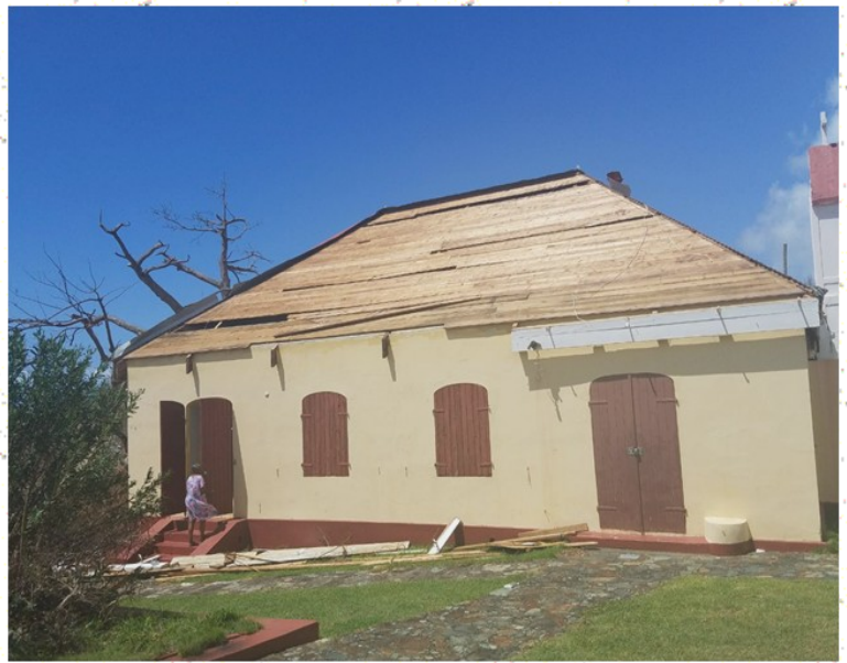
Damages caused by Hurricane Maria on St. Croix (Photos 11 - 14)