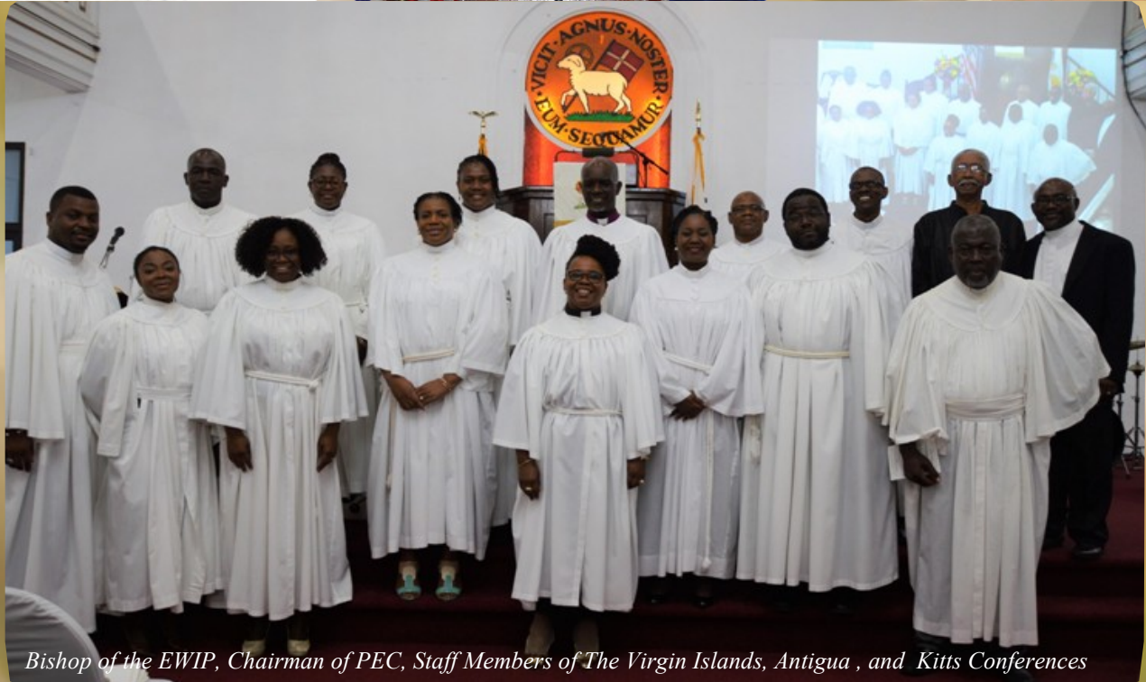
Bishop of the EWIP, Chairman of PEC, Staff Members of The Virgin Islands, Antigua , and Kitts Conferences