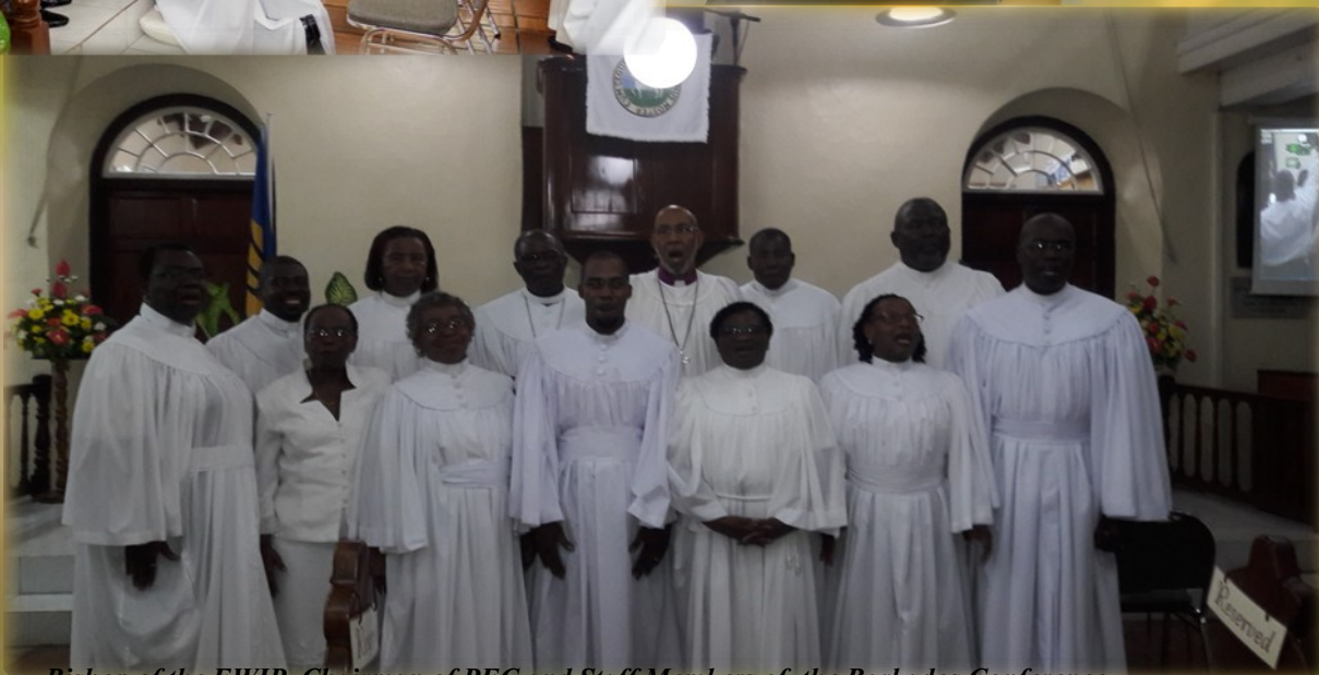
Bishop of the EWIP, Chairman of PEC and Staff Members of the Barbados Conference