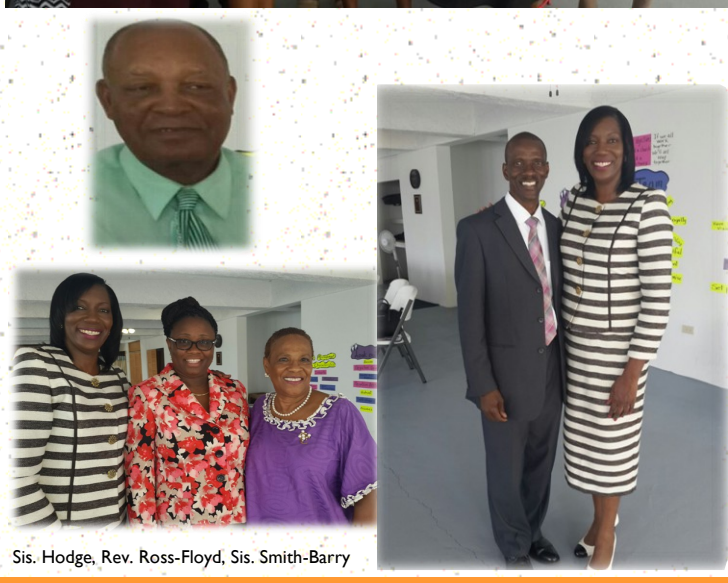
Fulfilling the Mandate - Advance the Kingdom