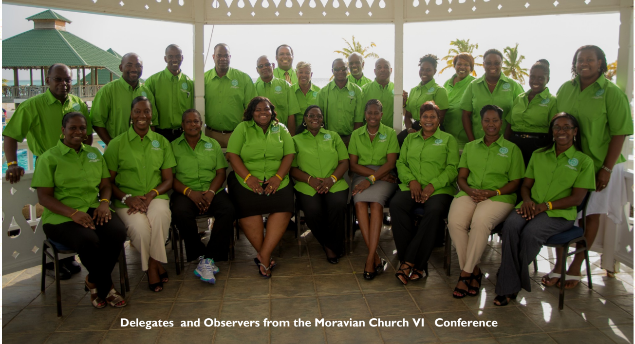
Delegates and Observers from the Moravian Church VI Conference