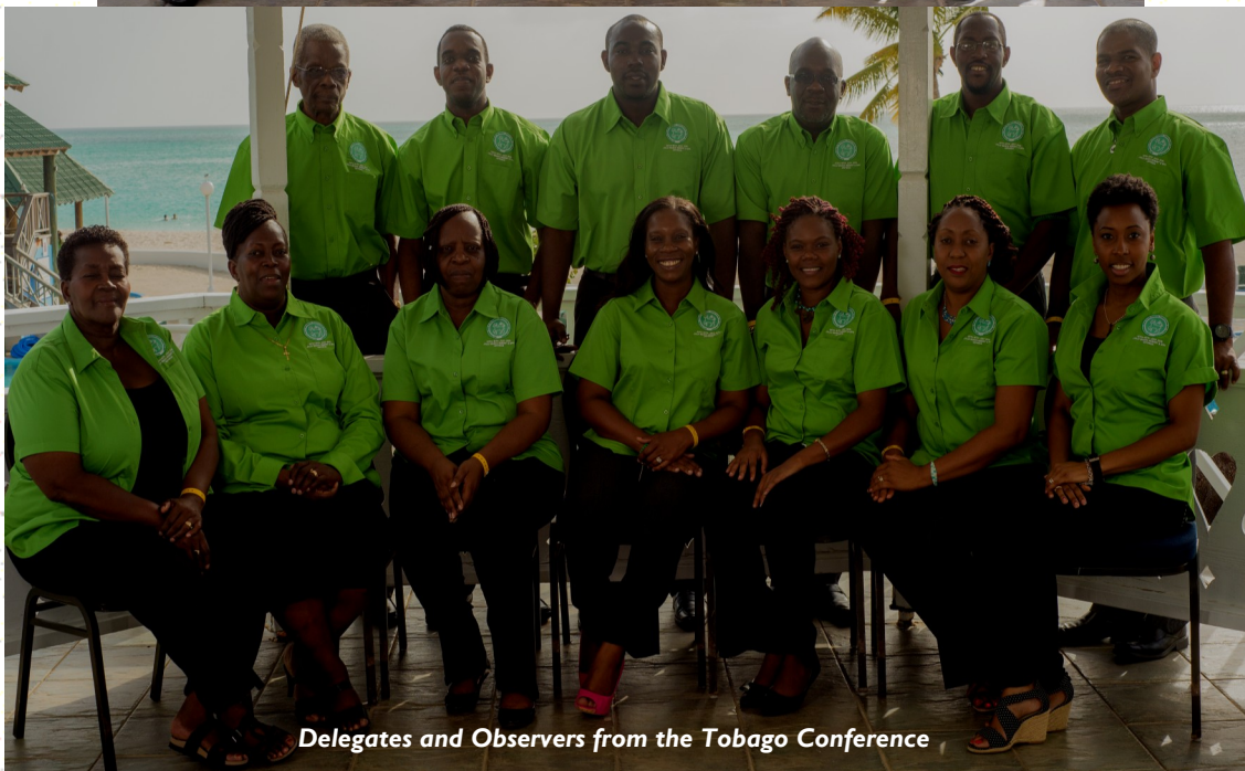
Delegates and Observers from the Tobago Conference