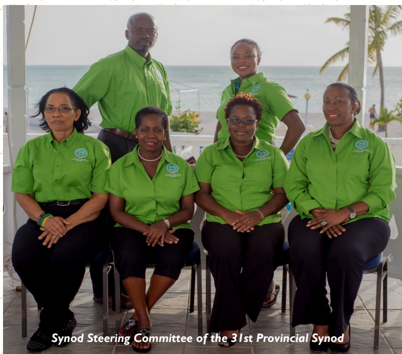
Synod Steering Committee of the 31st Provincial Synod