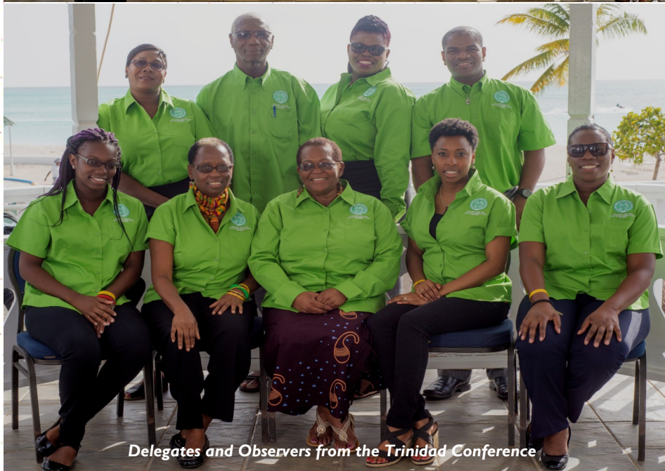
Delegates and Observers from the Trinidad Conference