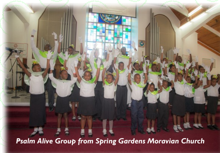
Psalm Alive Group from Spring Gardens Moravian Church