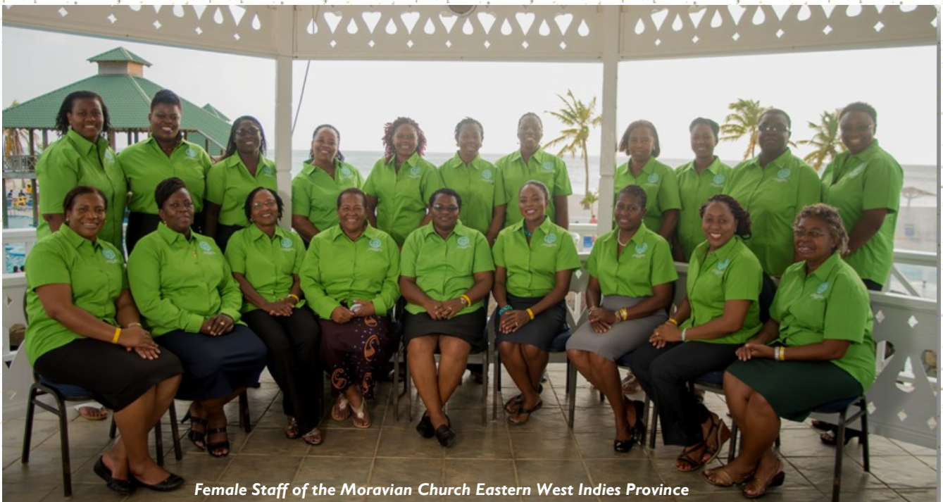
Female Staff of the Moravian Church Eastern West Indies Province