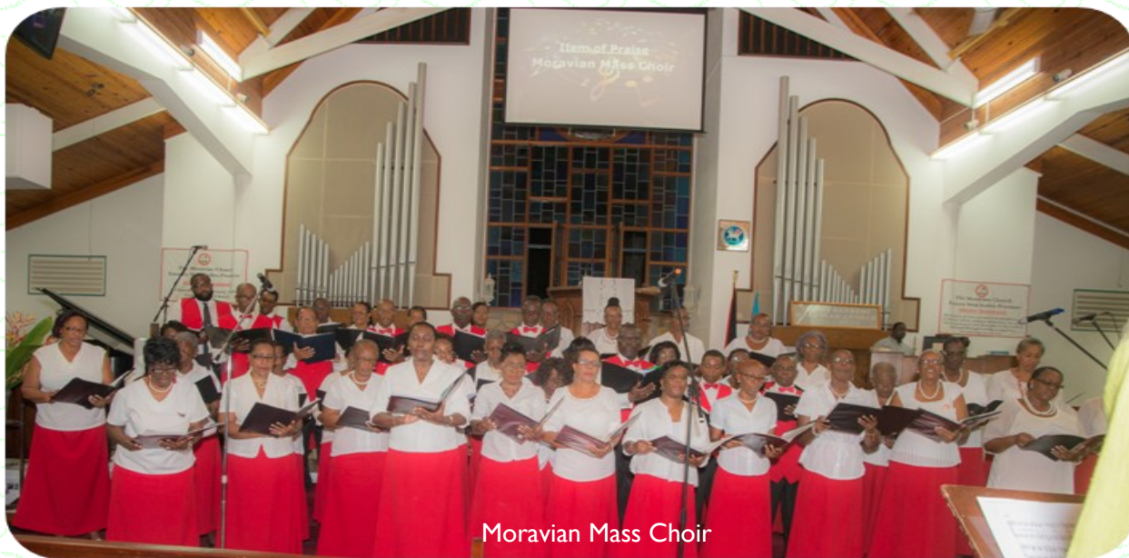
Moravian Mass Choir

Fulfilling the Mandate - Advance the Kingdom