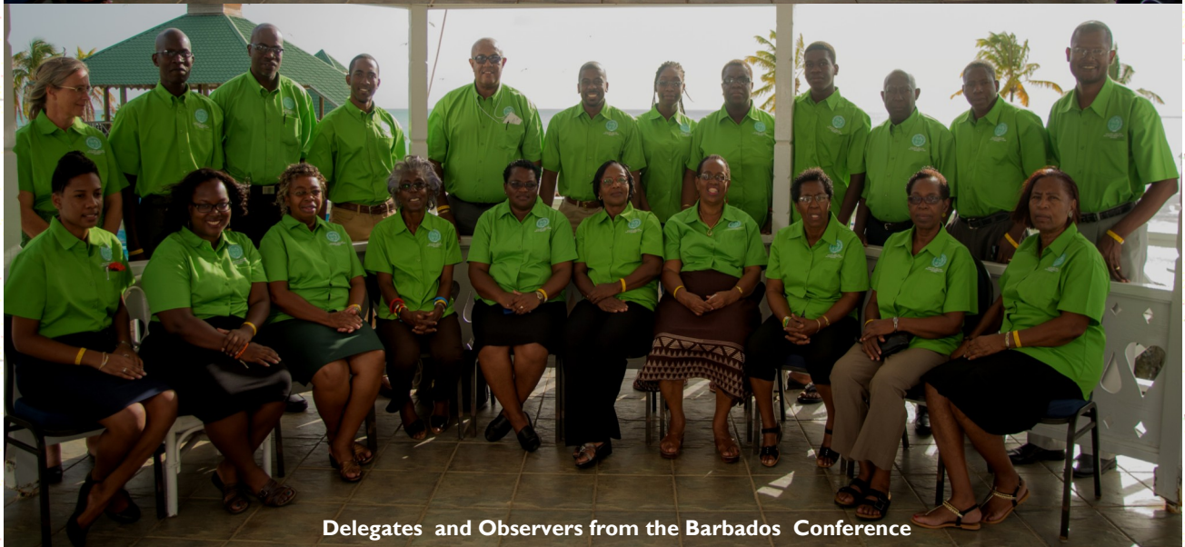
Delegates and Observers from the Barbados Conference