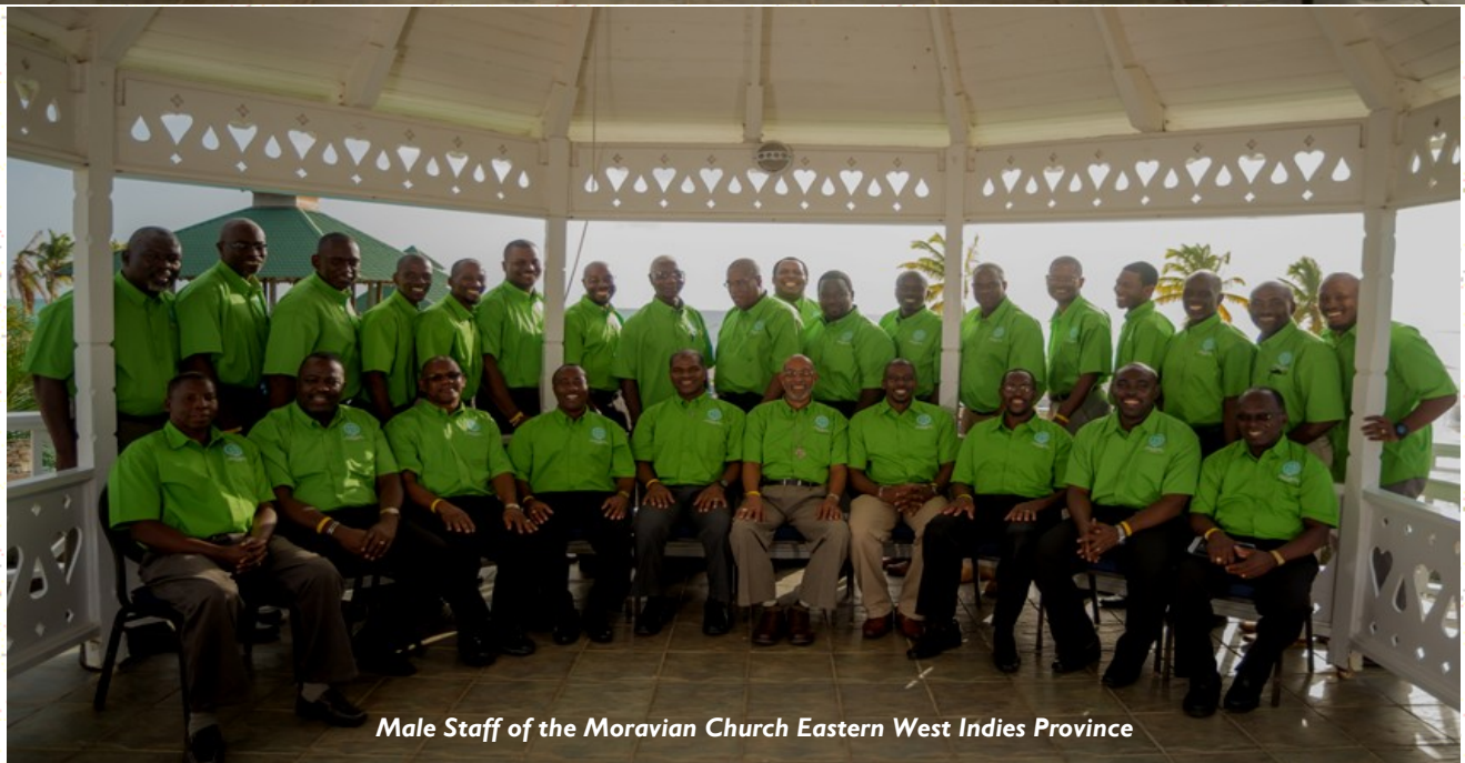
Male Staff of the Moravian Church Eastern West Indies Province