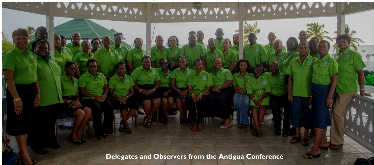
Delegates and Observers from the Antigua Conference