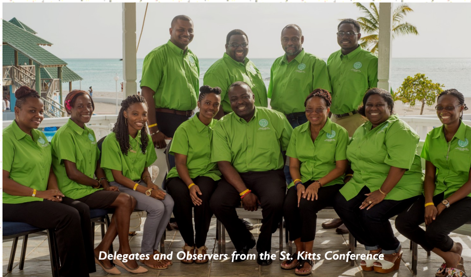
Delegates and Observers from the St. Kitts Conference