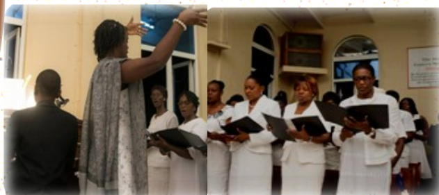
Joint Choirs Cedar Hall and Cashew Hill