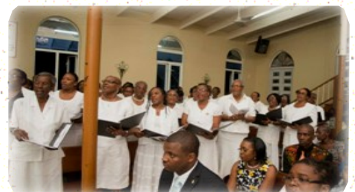
Moravian Mass Choir/section of the congregation

Fulfilling the Mandate - Step out in Faith