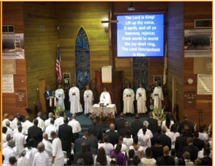
Closing Communion Service