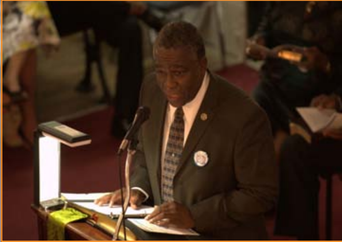
Greetings by the Lieutenant Governor Francis of the Virgin Islands