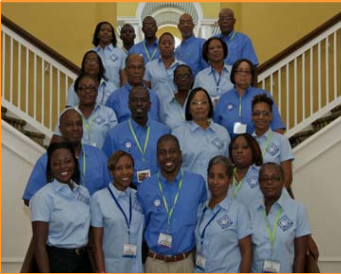
Antigua Delegation to Synod 2012