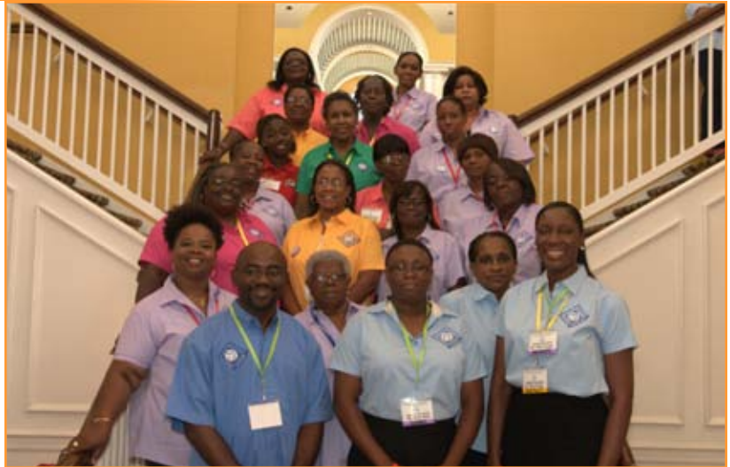
Synod 2012 Planning Committee