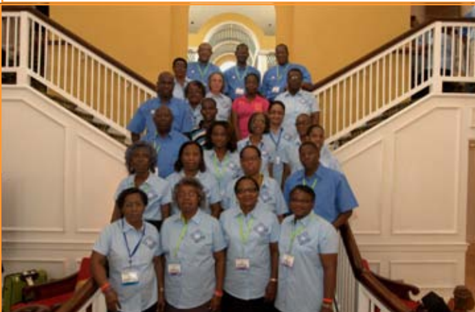
Barbados Delegation to Synod 2012