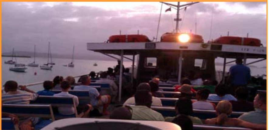
Boat Ride to St. John