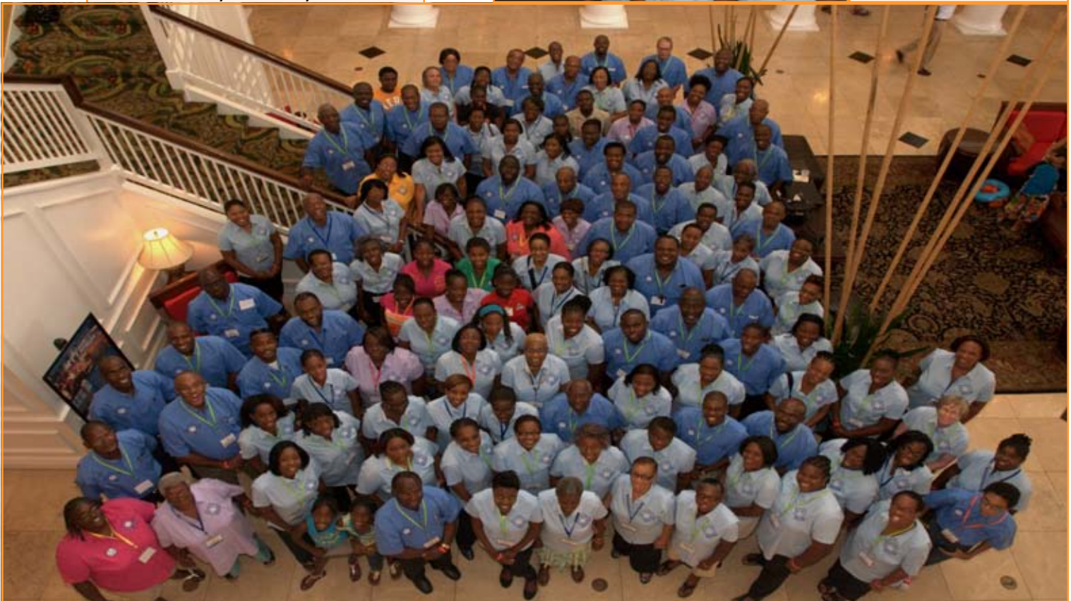
Synodals At the 30th Provincial Synod in St. Thomas,