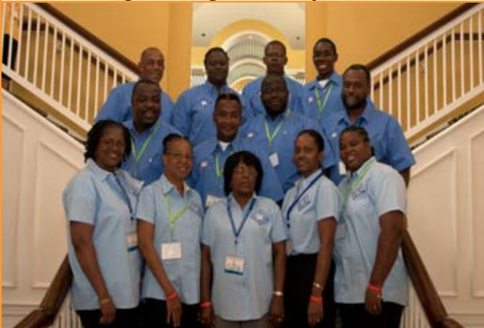
St. Kitts Delegation to Synod 2012