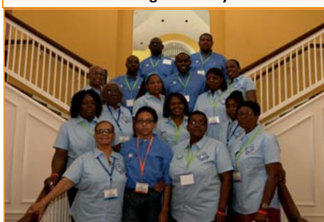
Tobago Delegation to Synod 2012