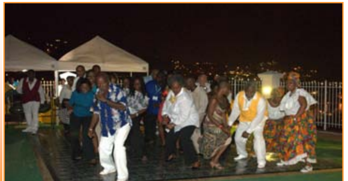
Watch we now, we getting down, we had lots of fun