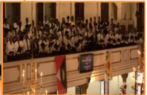
A Section of the Synod Choir