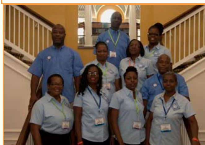
Trinidad Delegation to Synod 2012