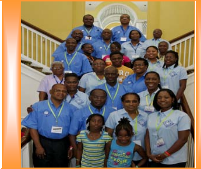
Virgin Islands Delegation to Synod 2012