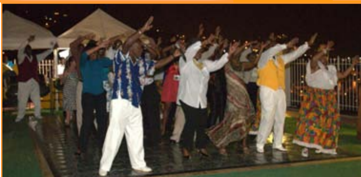
We Exercising, Hands up and Wave