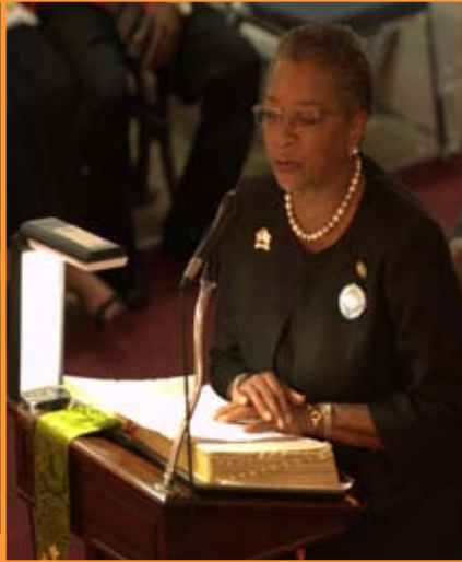
Greetings by Congresswoman Donna Christensen at the Opening Service