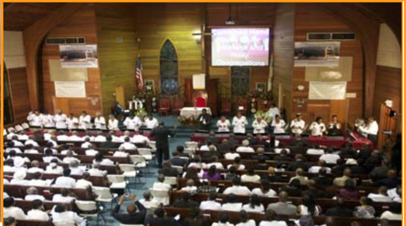
Hand Bells Choir