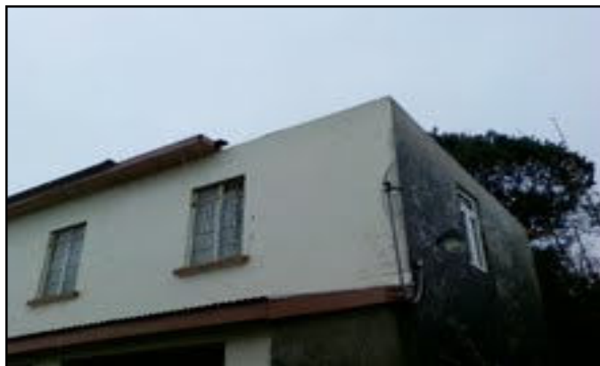
Sharon Moravian Manse in Barbados

In Barbados Tropical Storm Tomas crept up on them at about 2 am on Saturday October 30 and brought flooding, downed large trees and power lines and tore off the roofs from many buildings. Many houses were totally destroyed. The Strong winds tore off a section of roof of the Moravian Manse at the Sharon Moravian Church.