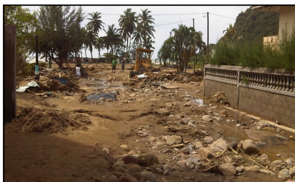
Roads damaged by Mud slides in St. Vincent

In particular, the Banana Industry in St. Vincent suffered untold damage. It is reported that the Banana Industry which is the main Industry of the country was almost totally destroyed. Two workers were hospitalized after being blown off a roof by high winds.