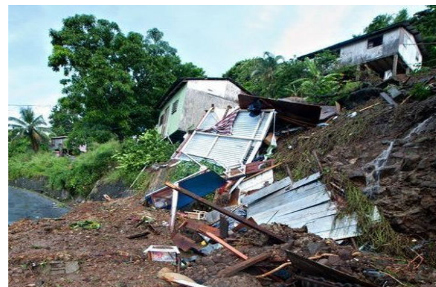
Landslides destroyed houses in St. Lucia