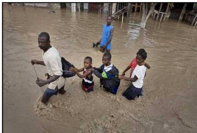
Flooded areas in St. Vincent

Widespread flooding triggered landslides that cut off as many as 30 roads, marooning hundreds of residents.