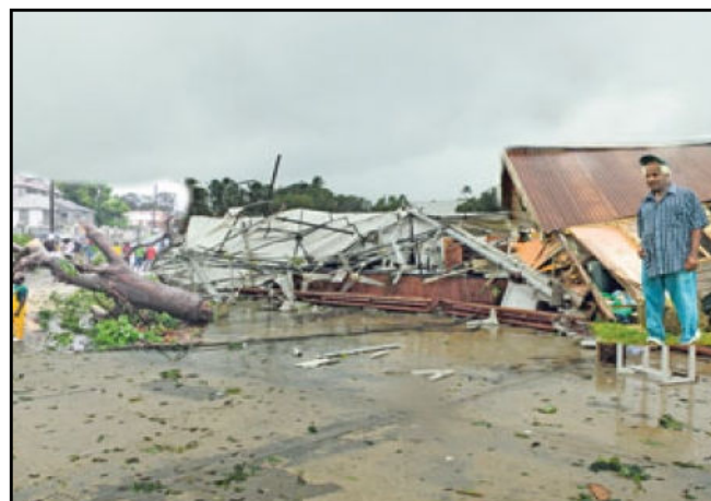
Dwelling houses Totally destroyed