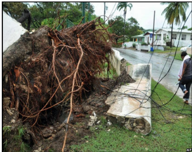
Trees Uprooted and wall & power-lines down

In St. Vincent and St. Lucia, the tropical storm developed into hurricane Tomas and devastated the Agricultural Industry.