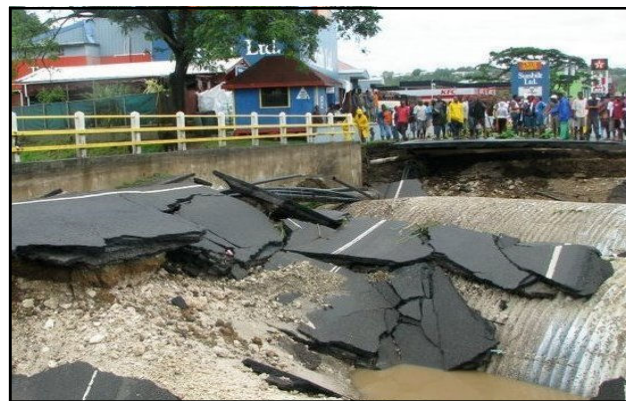
collapsed bridge preventing access from one area to another by road.